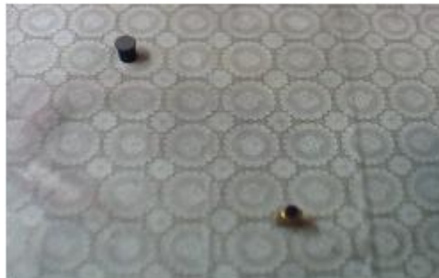
Figure 2: Day Time Image

Figure 2 represents that image is captured at day time. In this image two corks are used as stationary objects.