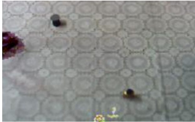
Figure 4: Enhanced Image Using Fusion Technique

The figure 5 shows that the resultant enhanced image has PSNR is 65.9 dB and MSE is 0.128 with the use of 0% noise in the original night image.